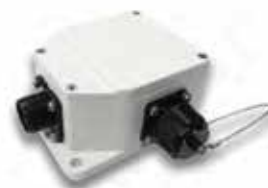
Refurbished AS21 Angle Sensor