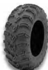
ATV Tire Only