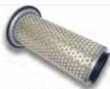
Air Filter Outer