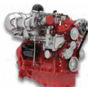
Deutz Tier 4 Interim Engine