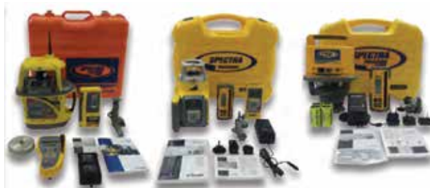
GL722 Dual Grade Laser

Quick Disconnect Kit for Transmitter..... 20942