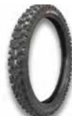
MX Tire Only