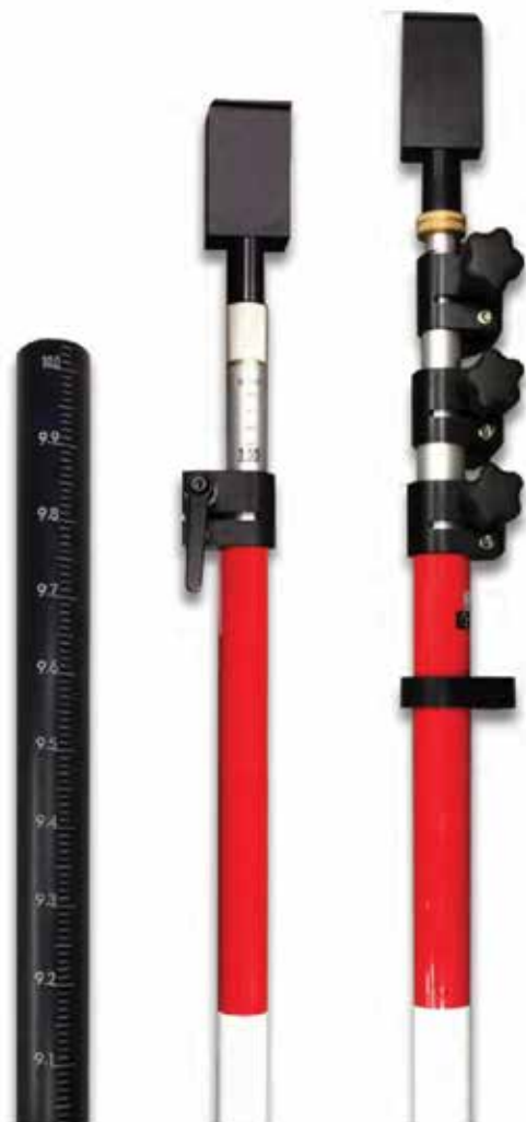
Etched Mast Tube 485/840 Grade Rod Large Line Grade Rod