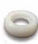
Roller Plow Auger Guard