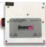
CBSSR Control Box