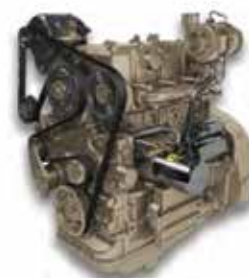
John Deere 4024 Engine