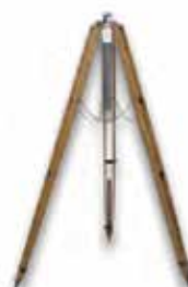
8ft Tripod w/ Elevating Base