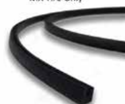
Wheel Guard Seal Outer