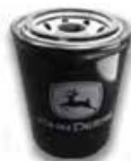
Oil Filter John Deere