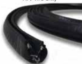
Wheel Guard Seal Inner