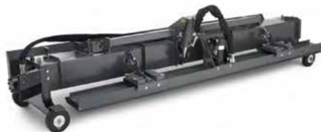
8ft Auger Head Assembly