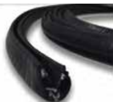
Wheel Guard Seal Inner