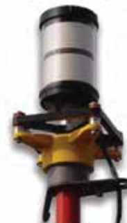
MT900 with Mount