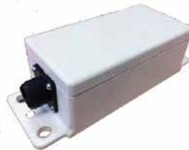
AS212-S Dual Axis Sensor