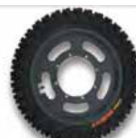
MX Wheel Assembly