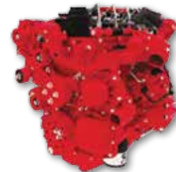
Cummins QSF2.8 Engine