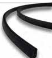
Wheel Guard Seal Outer