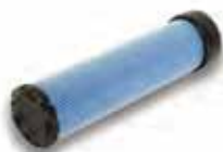
Air Filter Inner