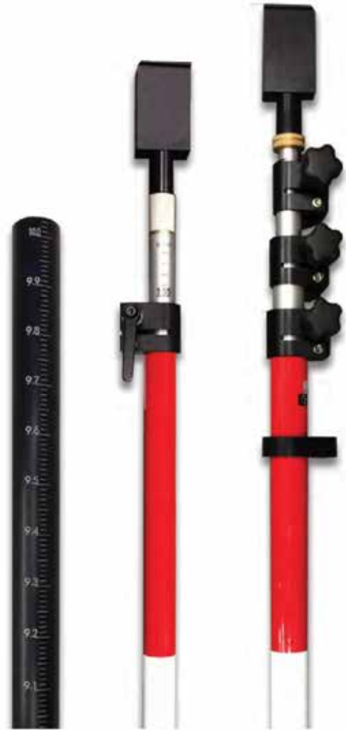
Etched Mast Tube