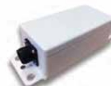
AS212-S Dual Axis Sensor