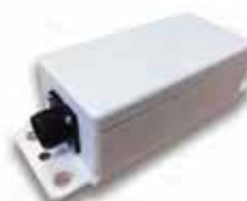
AS212-S Dual Axis Sensor