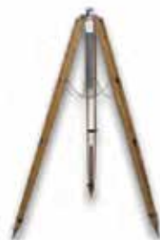
8ft Tripod w/ Elevating Base