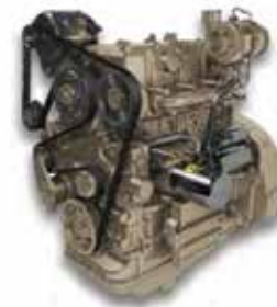
John Deere 4024 Engine