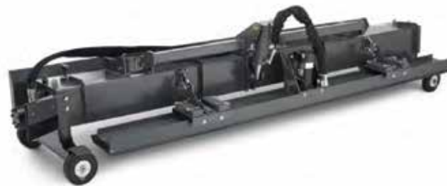
8ft Auger Head Assembly