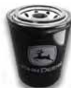
Oil Filter John Deere