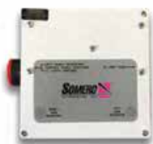
CBSSR Control Box