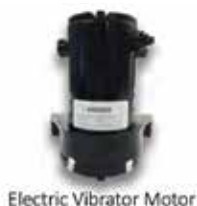
Electric Vibrator Motor