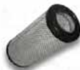
Air Filter Primary