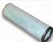
Air Filter Inner