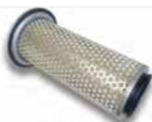
Air Filter Outer