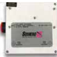
CBSSR Control Box