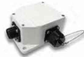
Refurbished AS21 Angle Sensor