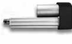
Linear Actuator with Hood