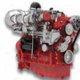
Deutz Tier 4 Interim Engine