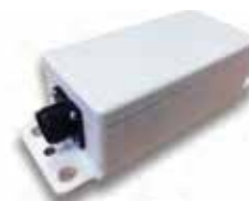
AS212-S Dual Axis Sensor