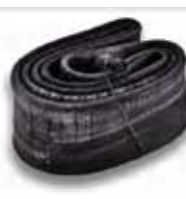
Tube MX 14"