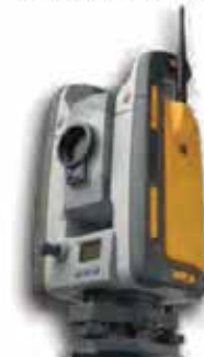
SPS 930 UPS