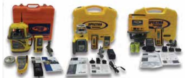
GL722 Dual Grade Laser GL622 Dual Grade Laser LL500 Single Grade Laser

Quick Disconnect Kit for Transmitter..... 20942